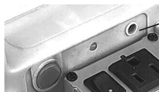
AC charger jack or DC charger jack